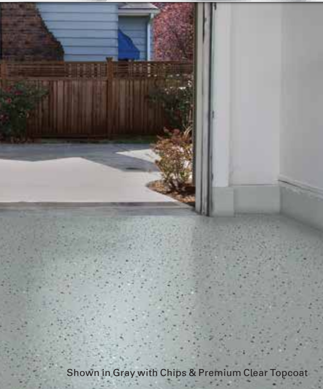
Shown in Gray with Chips & Premium Clear Topcoat