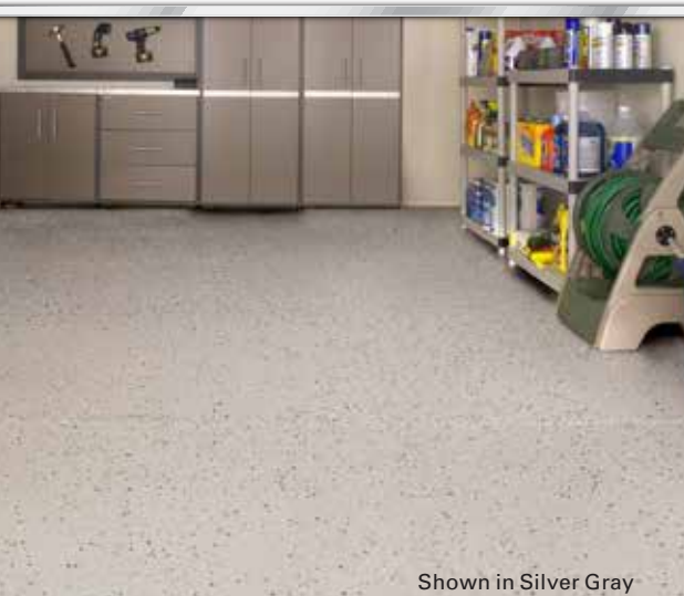
Shown in Silver Gray